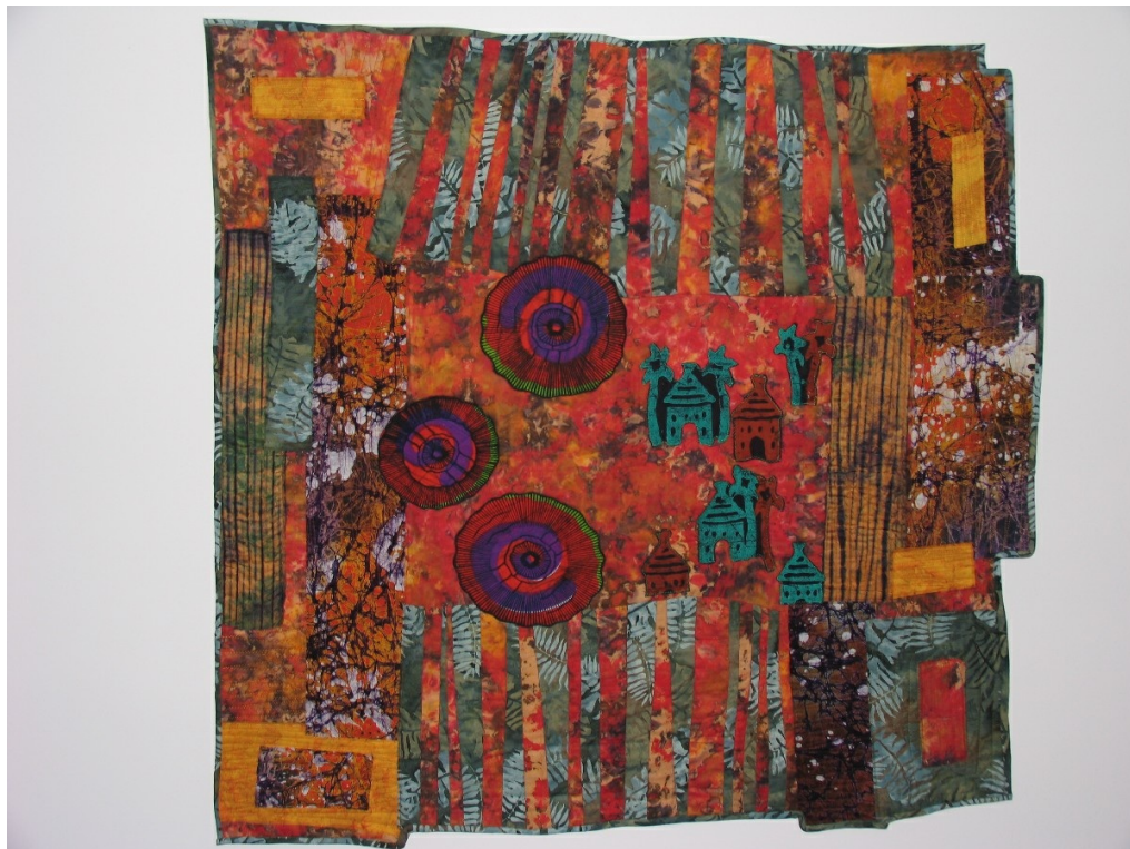
A New Day