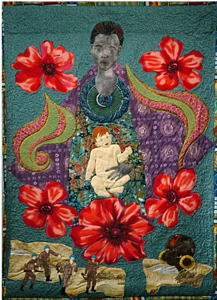
A Peacekeeper's Gift